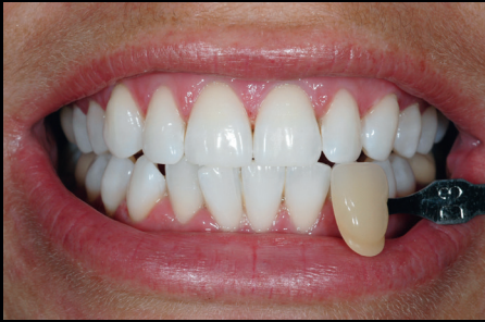
After Enlighten Whitening